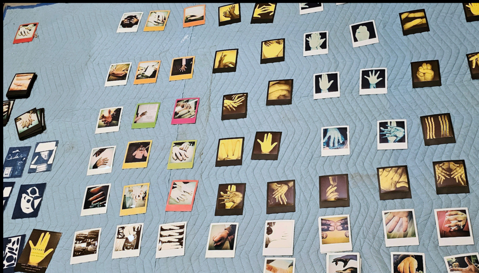
Installation views of All Hands Hold Polaroid hand portraits